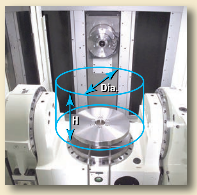
Max. Workpiece Dia. x H